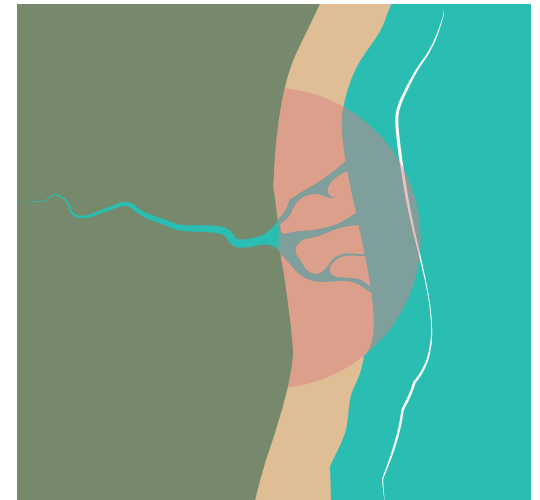
An example of an applying conservation zone of 500 meters. The red marking indicates the zone prohibiting all angling.

Please note, however, that more conservation zones may be added, as the population of the local trout evolves and expands. It is your duty as an angler to keep up to date with developments. Fortunately, this is easy, because you can see a map of these conservation zones at our isles on Sea Trout Fyn's website: www.en.seatroun.dk/map - do a mouse-over' on the specific location to see which rules that apply specifically.